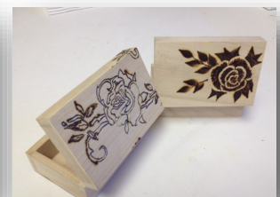
Hobby/Craft Items crafted by residents of Alpha House