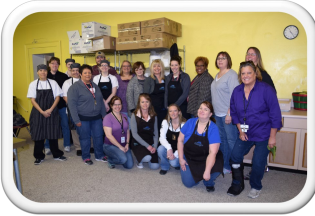
Alternatives' staff ready to serve a meal at the "Bring a Meal" event at the local mission.

Beta Jail Alternatives had an annual goal this year to give back to the community by completing two community service projects. This year, staff from Beta partnered with the Montana Rescue Mission, Women's Shelter, and the Crisis Center. Seventeen staff from Beta, Alpha, and Passages set up, served the meal, and cleaned up at the local mission.