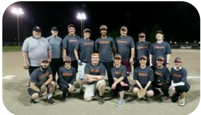
Alternatives’ “TOMcats”. Several staff have signed up to play softball this season