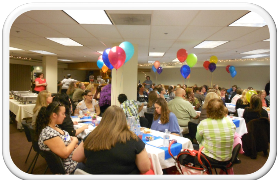
Passages Staff and Alumni celebrate Passages' 7th Annual Alumni Celebration at the Valley Federal Credit Union building downtown on April 1st.

Our Alumni celebration continues to grow each year and we look forward to holding the 8th annual celebration in 2017!